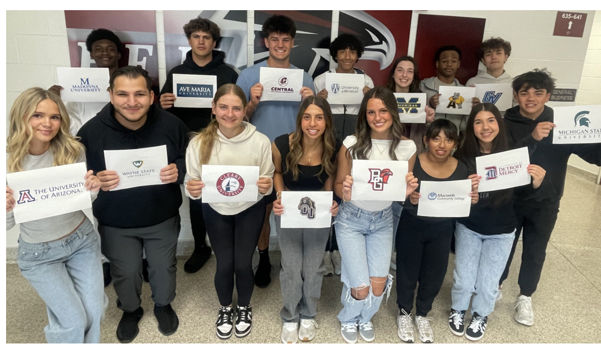
Henry Ford II seniors showcase where they are heading after graduating high school.

We look forward to continuing to build upon this legacy of excellence in partnership with our community.